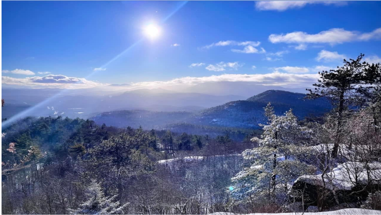
Adirondack Mountains, Keene Valley, NY